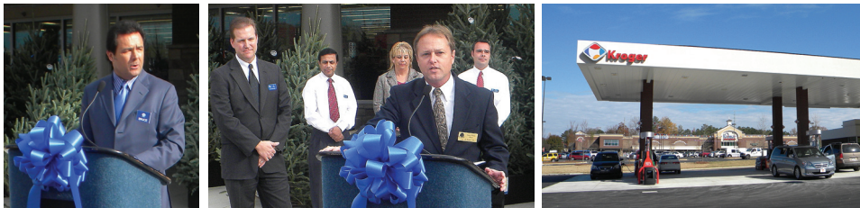
November 18, 2010